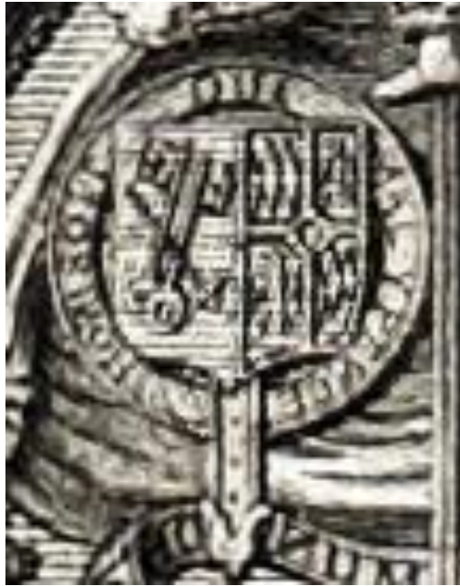
Fig. 16 Bishops James' arms from 1798 engraving 42

There is, however, an important difference between the 1798 engraving and the current doors. Beneath the arms runs part of the first line of Psalm 113 " Ecce quam bonum, et quam jucundum habitare fratres in unum " ["Behold how good and pleasant it is for brothers to dwell together in unity" 43 ] which would seem to be a very good quotation for doors commemorating one brother by another. The doors do not exhibit the entire line, however.