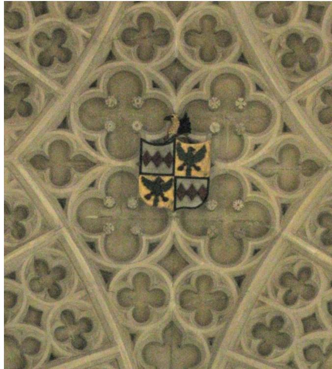
Fig. 4 Montagu arms in the Nave, Bath Abbey

The arms on the north side of the doors are those of Bishop James Montagu.