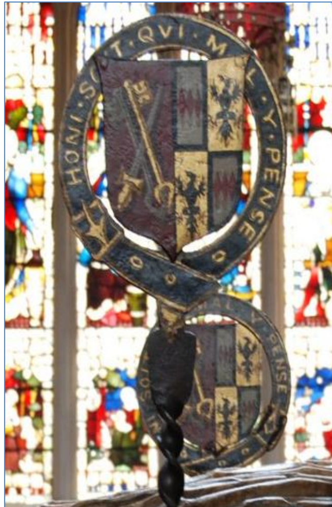
Fig. 8 Arms on Bishop Montagu's tomb

There are questions, however, about the Bishop's arms themselves. There are many examples of them on his tomb