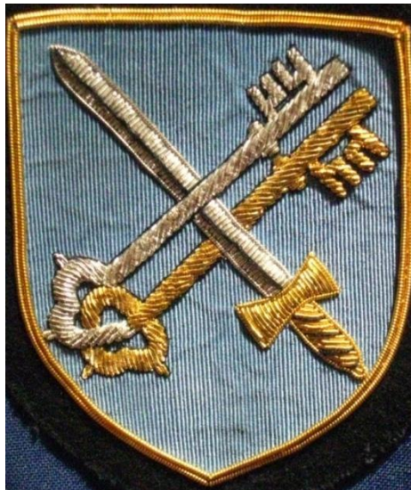
Fig. 15 Current arms of Bath Abbey 41

Well, maybe not unique. Similar arms are used by the Abbey today. The date of the change to these arms is uncertain, even if those on the door do not show the colour, although the current arms are " certainly recorded in the 19 th century " 40 . It is noted, however, that the current arms do not follow the convention, seen above, that the sword lying over the keys is or .