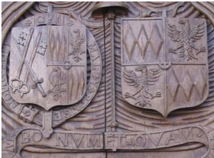
Fig. 5 Close up of Montagu arms on Bath Abbey doors

The upper arms on the door display differences , those of the bishop the annulet of the fifth son, which is correct as James was " filius quintogenitus " 18 of his father Edward.