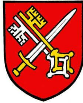
Fig 10 Arms of the See of Winchester

So it is almost certain that the arms on Bishop Montagu's tomb are those of Winchester, which was his seat when he died in 1617.