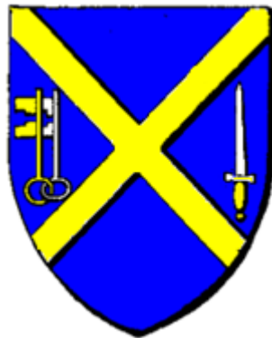
Fig 13 Bishop Montagu's arms for the See of Bath and Wells

Bishop Montagu seems to have used the arms described above, but instead of impaling them with the saltire 36 of Wells in the ordinary manner he incorporated Bath by placing the keys and sword on the dexter and sinister, respectively, of the saltire of Wells.