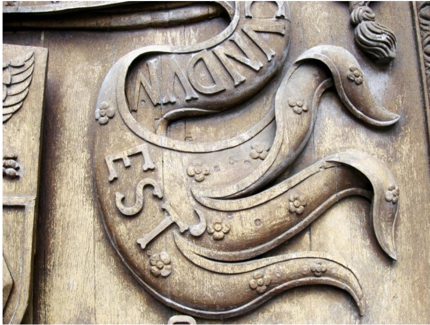
Fig. 18 The current inscription

Once again this might be the result of another error in the engraving. However there are multiple records of the inscription, by authors as diverse and respected as John Britton 46 and Charles Dickens 47 , which all record it as ending with "etc". This suggests strongly that the engraving is accurate and that the engravings now seen on the doors are not the originals.