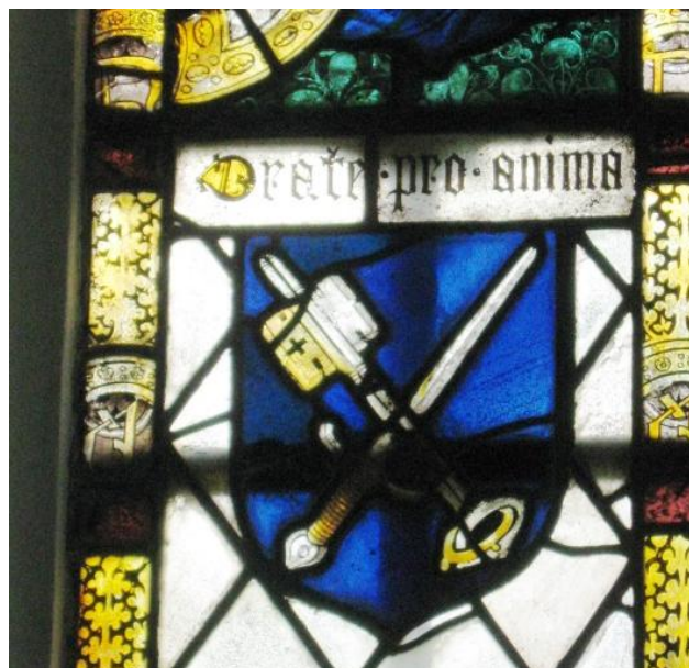
Fig 9, Arms of Bath Priory 1499 from St Catherine's church, St Catherine, Bath

These arms can be dated to at least the end of the fifteenth century 31 . They appear in Prior Cantalow's lovely stained glass window in St Catherine's church, located in the eponymous hamlet four miles north east of Bath. The arms in the window are given in Colinson's 18 th century survey of Somerset as "the arms of the abbey viz a St Peter's key crossed with a sword" 32 .