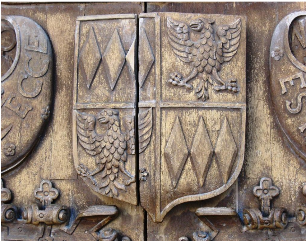
Fig. 3 Montagu arms on the West Doors

The arms are seen in a number of places in the Abbey, most prominently on the West Doors