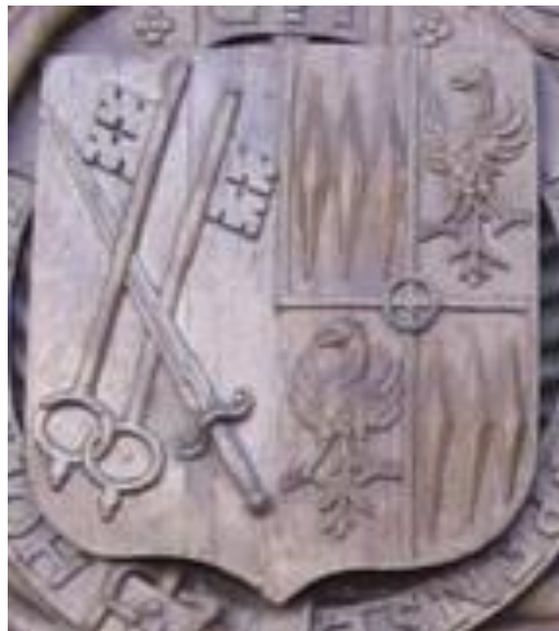
Fig .14 Arms of Bishop Montagu on the West Doors today

The arms carved onto the West Door do not, of course, have any colour but they do show this arrangement of keys and sword, with them laying along the relevant diagonals but this makes the sword in bend and the keys in bend sinister , the reverse of the Priory and early Abbey arms and of Winchester