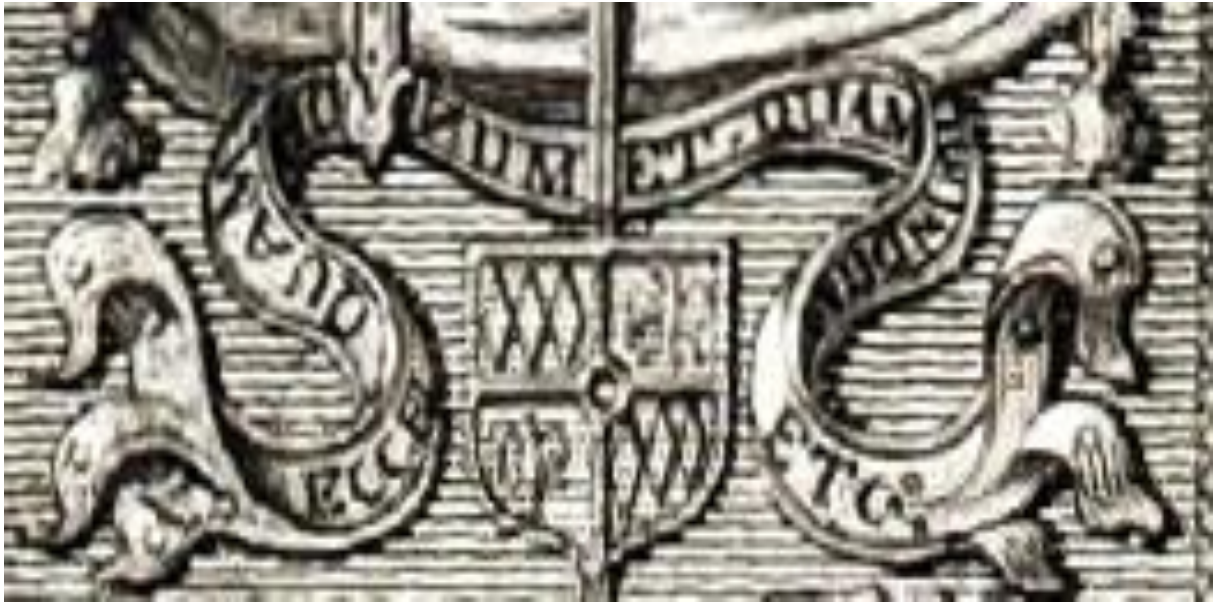
Fig 17 Inscription on doors 1789 44

The engraving clearly shows that it stops after the word " jucundum ", presumably because of lack of space, and refers to the rest of the (well known at least at the time) line by " etc ". The description of the doors in the Society of Antiquaries book confirms that