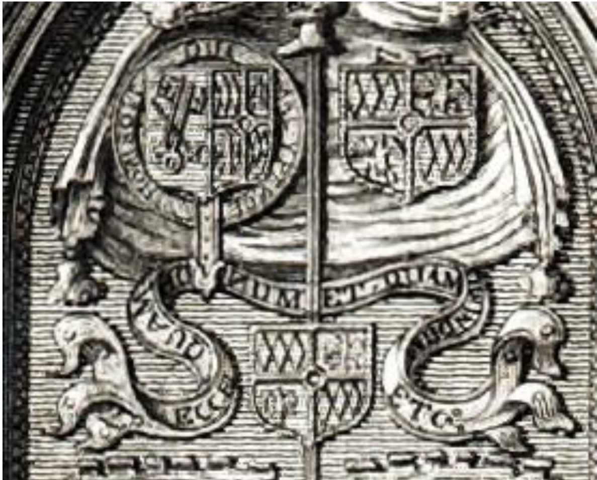
Fig. 7 Enlargement of the central part of the doors 1798 28

accurate survey of Bath Abbey and one of the illustrations shows the West Front . The accuracy of this image is believed to be very high, given that this was a scale plan drawing of the Abbey and such small details as the lettering of the Garter motto around James' arms are clearly shown.