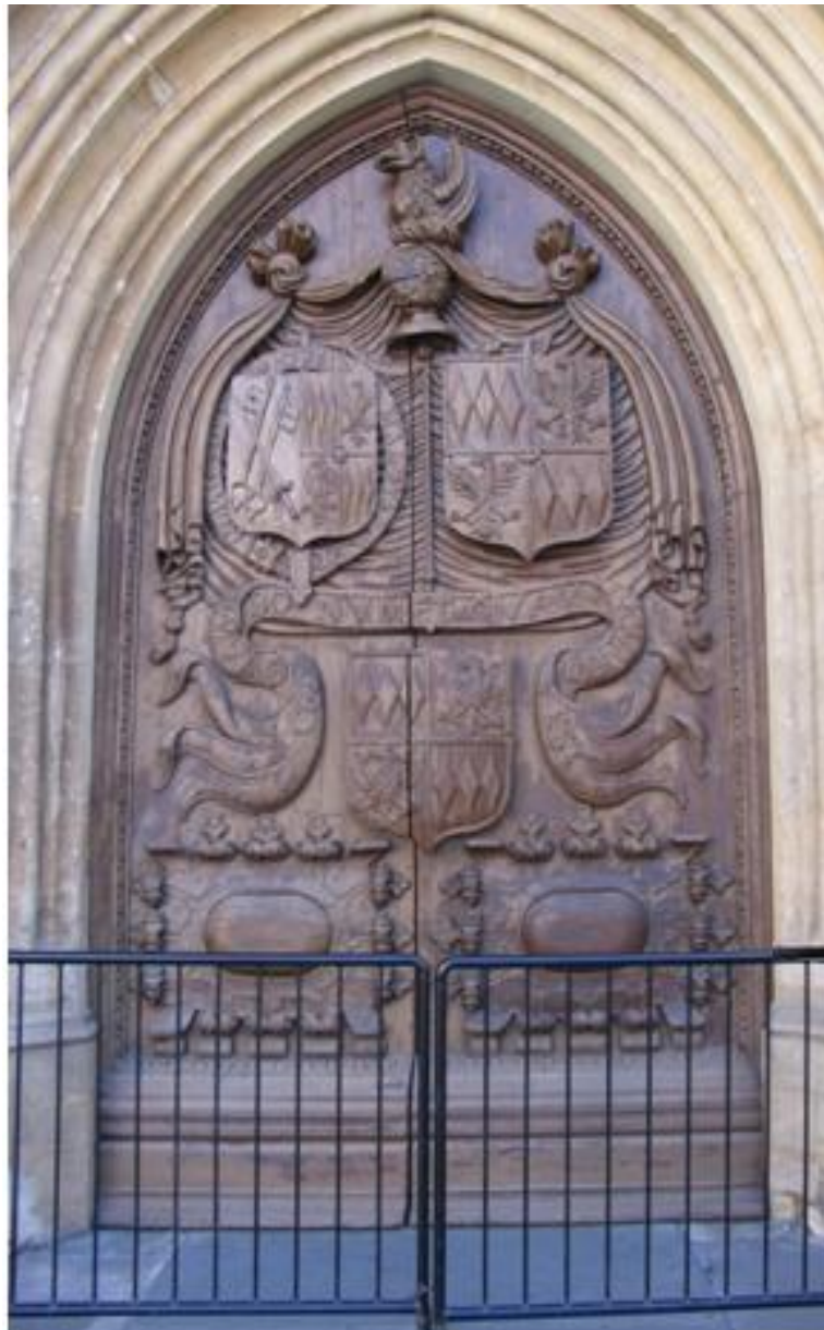
Fig. 1 The West Doors of Bath Abbey 2